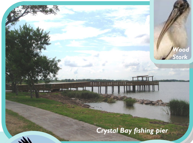
Crystal Bay fishing pier

The Baytown Nature Center, which is operated by the Parks and Recreation Department of the City of Baytown, was formerly the residential subdivision of Brownwood. Over the years, the land subsided due to the withdrawal of oil and groundwater, and the neighborhood suffered problems with flooding. In 1983, Hurricane Alicia struck the final blow, damaging many of the homes. During a community meeting in 1991 the idea arose to turn the area into a nature center. City officials seized the idea and began development of the Baytown Nature Center. Today, the site features picnic shelters, four fishing piers, two pavilions and two overlooks. It also includes the Crystal Bay Butterfly Garden, the Children's Nature Discovery Area and approximately seven miles of hiking trails.