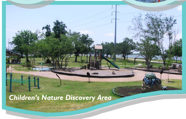
Children's Nature Discovery Area